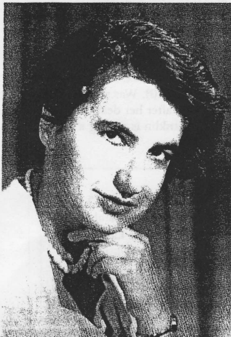
Rosalind Franklin